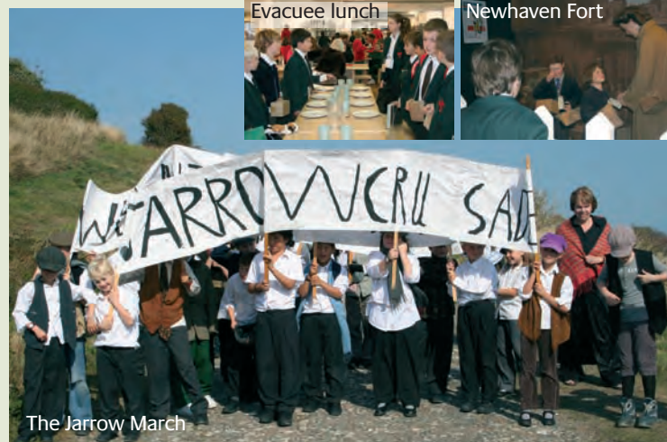
The Jarrow March

later was testament to the success of this ever popular Integrated Studies trip.