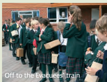
Off to the Evacuees' train